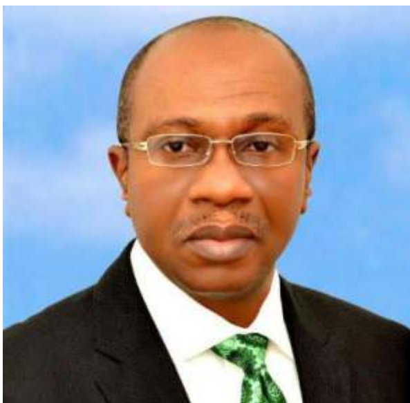
Mr. Godwin Emefiele Governor, Central Bank of Nigeria

T he Governor, Central Bank of Nigeria (CBN). Mr. Godwin Emefiele, has said that the various initiatives and interventions of the Bank were introduced to harness the opportunities in the non-oil sector to create wealth for the country.