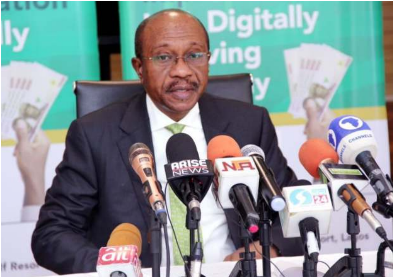
Mr. Godwin Emefiele