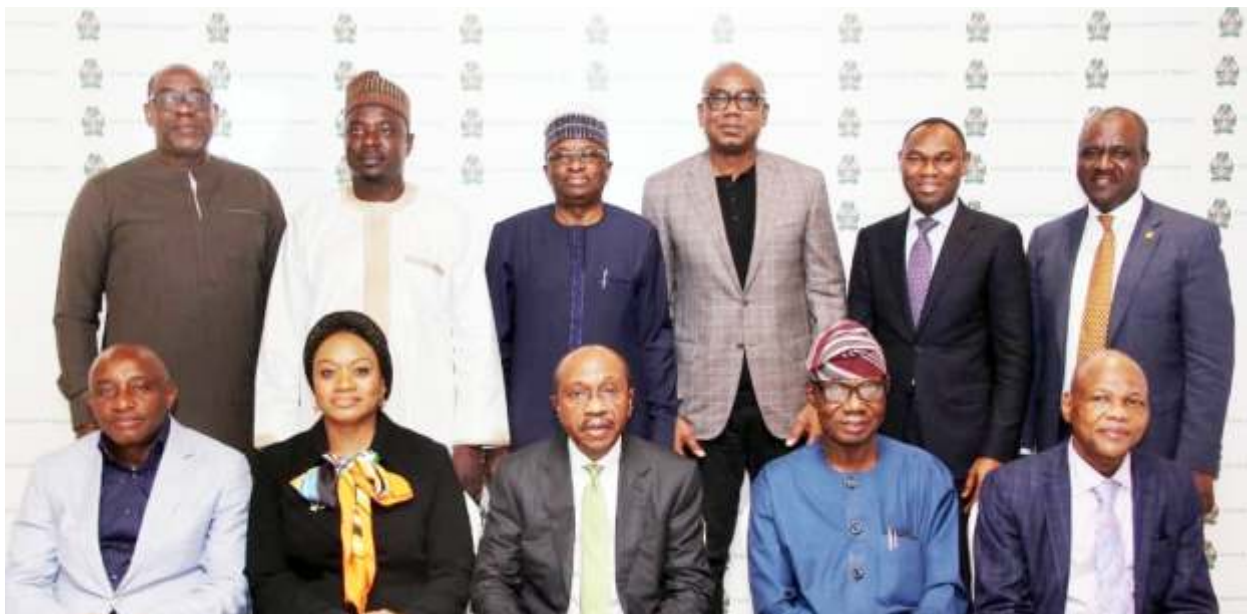
CBN Governor and Chairman, Monetary Policy Committee (MPC), Mr. Godwin Emefiele (middle) flanked by other members of the MPC at the Retreat

A t the recently held Monetary Policy Committee (MPC) 2022 Retreat in Lagos, Mr. Godwin Emefiele, Governor, Central Bank of Nigeria (CBN) declared that the CBN homegrown policy measures had revived the Nigerian economy.