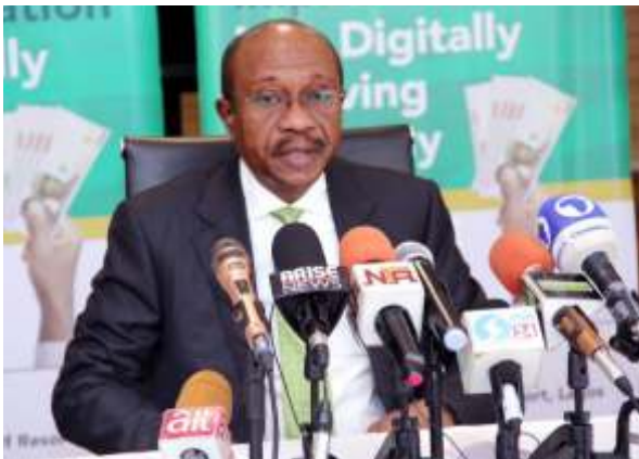
Mr. Godwin Emefiele Governor, Central Bank of Nigeria

G overnor of the Central Bank of Nigeria (CBN), Mr. Godwin Emefiele, has emphasized the contribution of digital technology and innovations to accelerated economic growth.