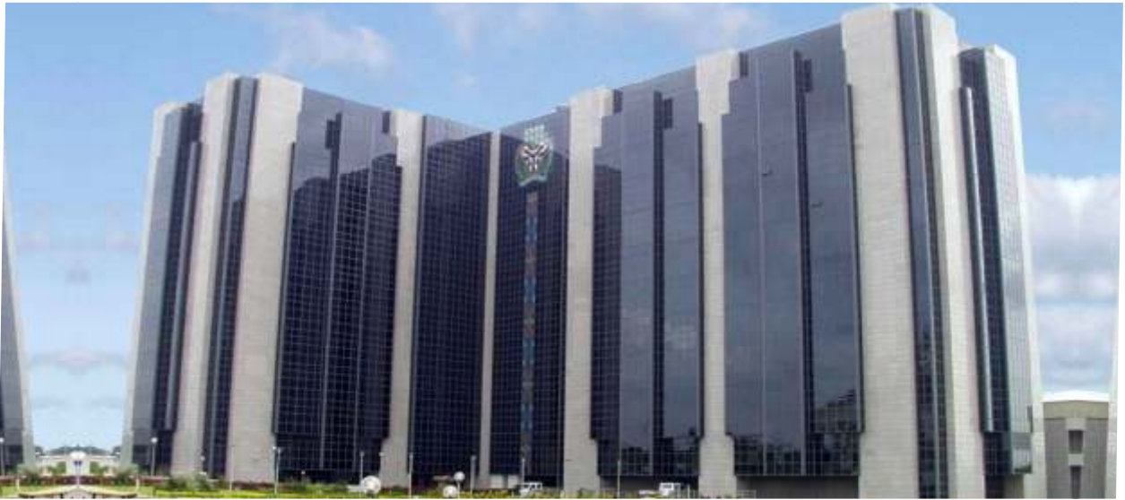
CBN Headquarters, Abuja

unauthorized movement of funds within and outside the country and would use tools at its disposal to sanction such acts.