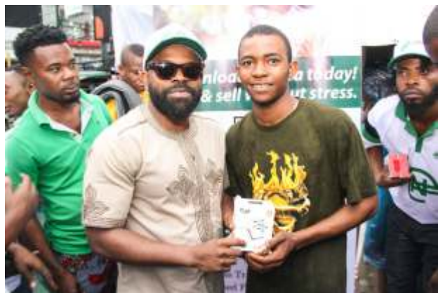
The eNaira Ambassador and Nigerian actor, Mr. Gabriel Afolayan with a trader who was on boarded to the eNaira platform during the road show

The eNaira is the Africa's first Central Bank Digital Currency that provides a unique form of money denominated in Naira. It was launched by President Muhammadu Buhari on October 25, 2021, and offers several benefits including, more effective monetary policy, increase in remittances, improve in financial inclusion, and cross border trade, amongst others.